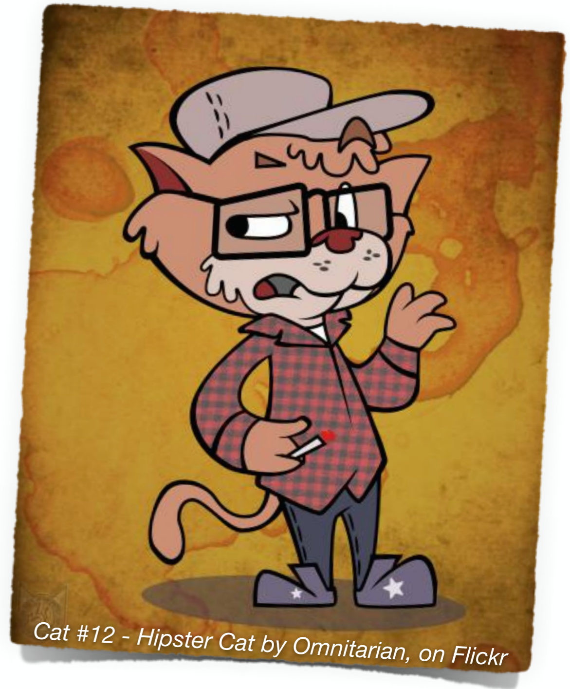
Cat #12 - Hipster Cat