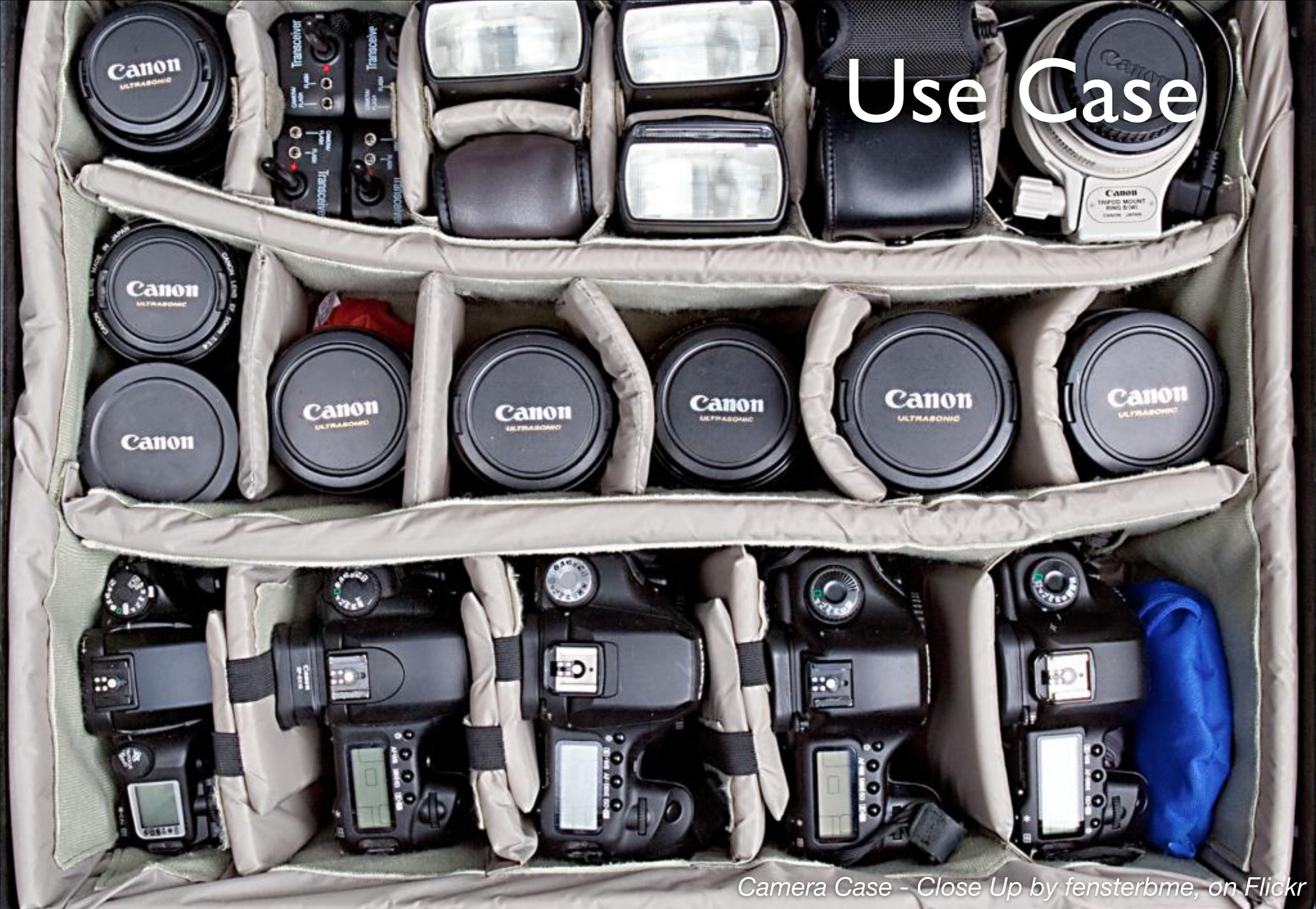
Camera Case - Close Up