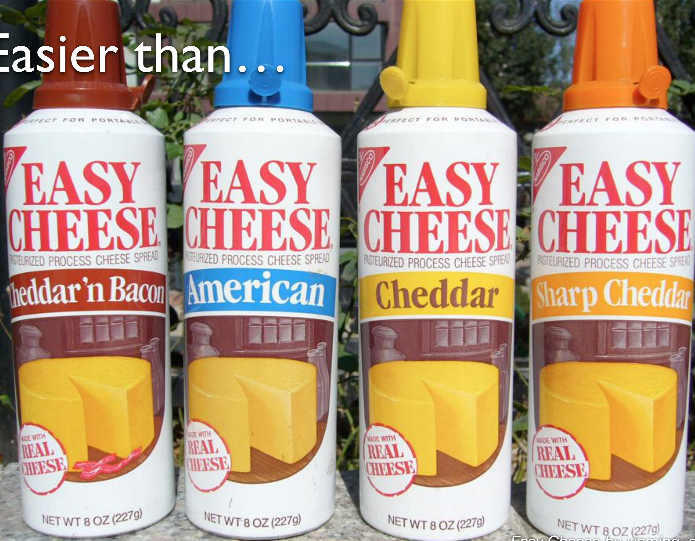
Easy Cheese